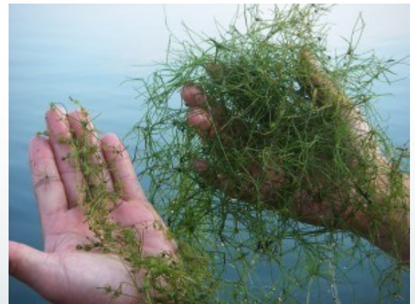
Native Chara (left), Starry stonewort (right).